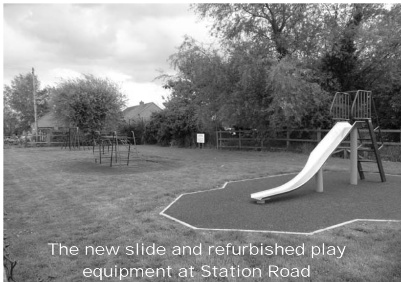
The new slide and refurbished play equipment at Station Road

May 18th, June 1st, June 15th and June 29th (No service on May 4th: Bank Holiday)