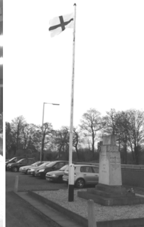
The Bedford Morris Men entertain (left) St George's flag flies proudly from our pole (right)