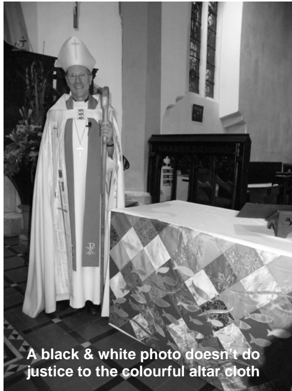
A black & white photo doesn't do justice to the colourful altar cloth

Then we feasted out in the churchyard until dusk fell at bed-time!