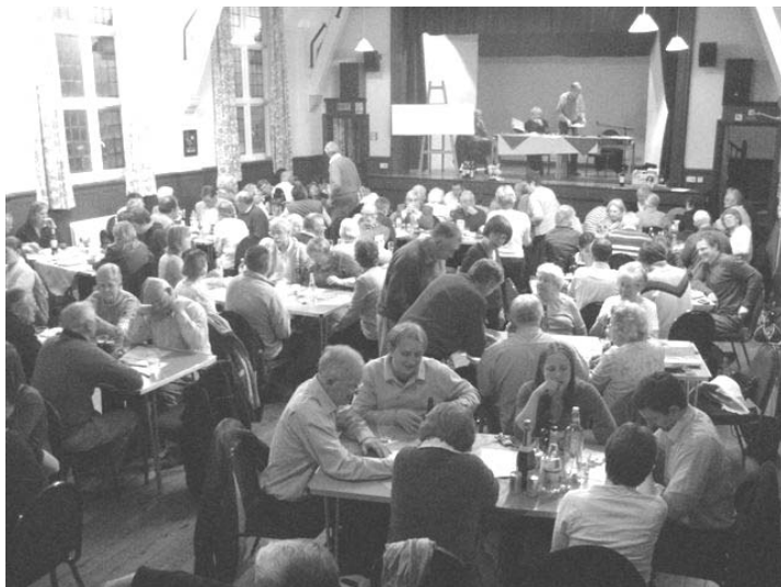
(The quiz teams busy at work!