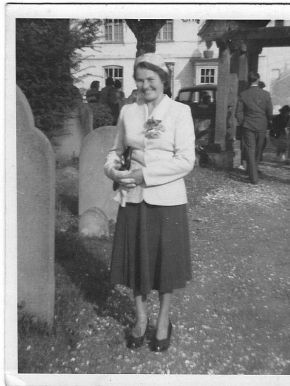
This photo was taken outside St Peter's after a wedding in 1955

the countryside she loved [and she could name every tree and flower and bird, giving the "country name" as well as the "book name" in many cases] but entered neither into politics nor gossip.